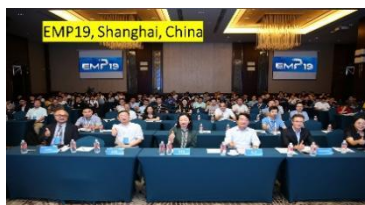
EMP19, Shanghai, China