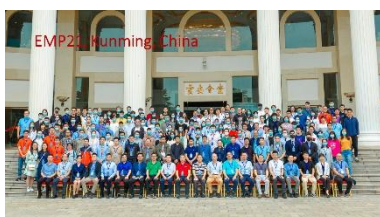
EMP21, Kunming, China