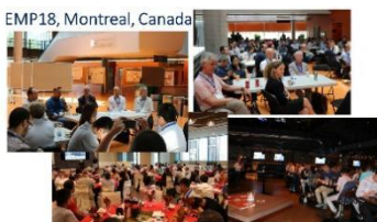
EMP18, Montreal, Canada